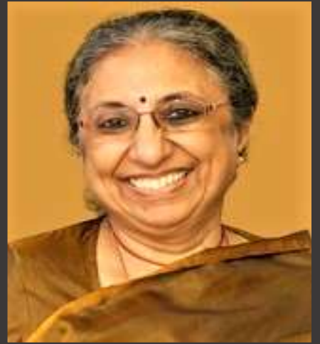
JUSTICE PRABHA SRIDEVAN Translator